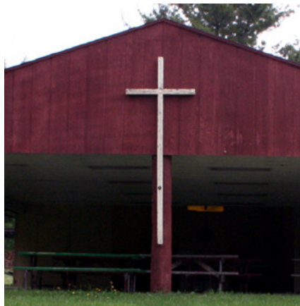
Open Air Shelter/Chapel