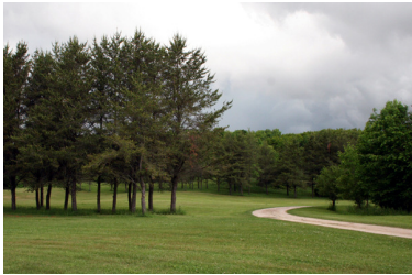
One of many camping areas