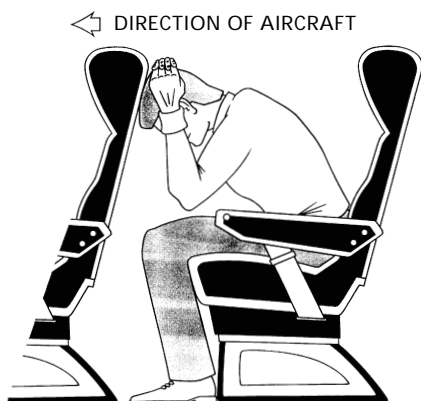
'forward facing passenger brace position'

possible with the chest close to the thighs and knees and the head touching the back of the seat in front. The hands should be placed one on top of the other on top of the head with the forearms tucked in against the side of the face. Fingers should NOT be interlocked. The lower legs should be inclined aft of the vertical with the feet flat on the floor. The seat belt should be as tight as possible and low on the torso.