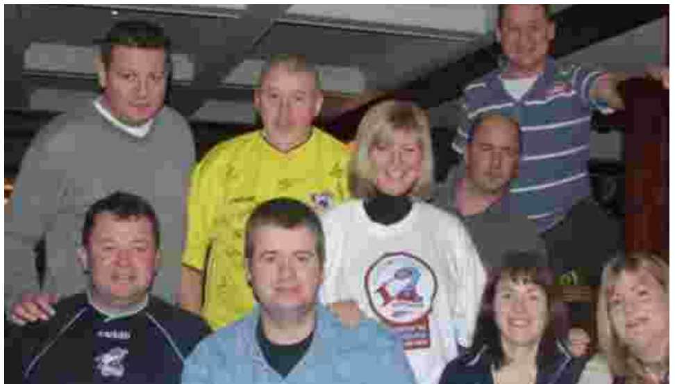
A group of Irish Iron members met up to watch the Iron live on SKY last season, pictured in the Foxhunter pub in Dublin