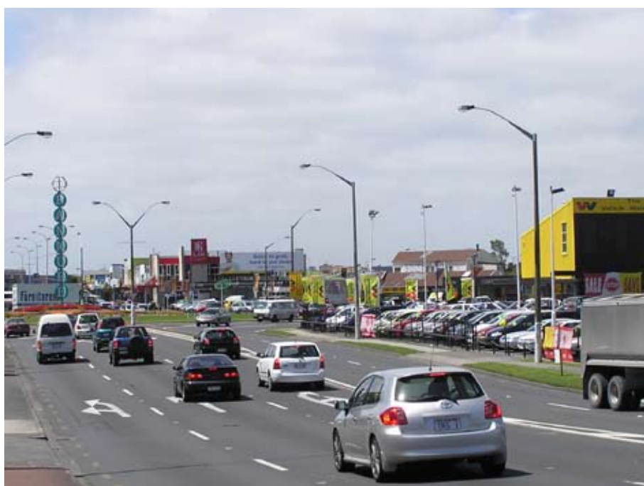
Pedestrian unfriendly: the Panmure roundabout