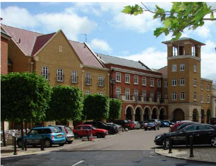
above: Concourse area within the Waterside development