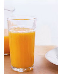
Powdered Orange Juice