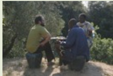
Conversation during the Berkana Art of Learning Centering Gathering, 2007

Our Work We see life as a living system. We see complexity as an inherent part of life. Complexity is how life evolves. Our work is to participate in hosting the next level of our human evolution by learning competencies that embrace the potential and possibility that reside in complexity. We do this by inviting people to use their innate human competence of being in conversation - specifically, conversations that they have never had before, yet deeply matter for co-