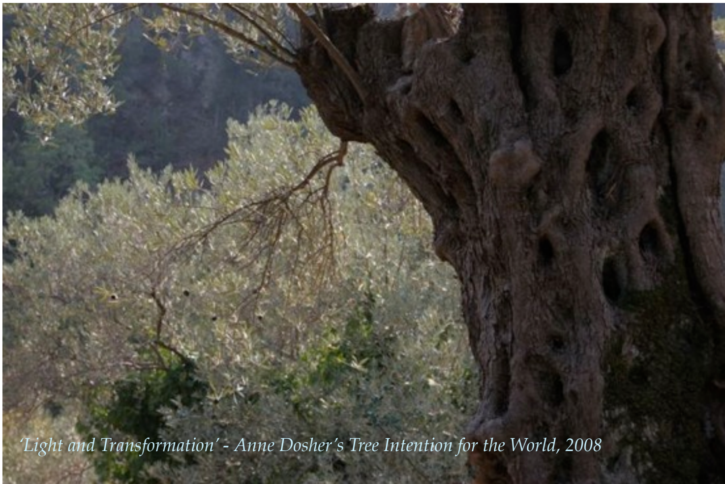
'Light and Transformation' - Anne Doshier's Tree Intention for the World, 2008