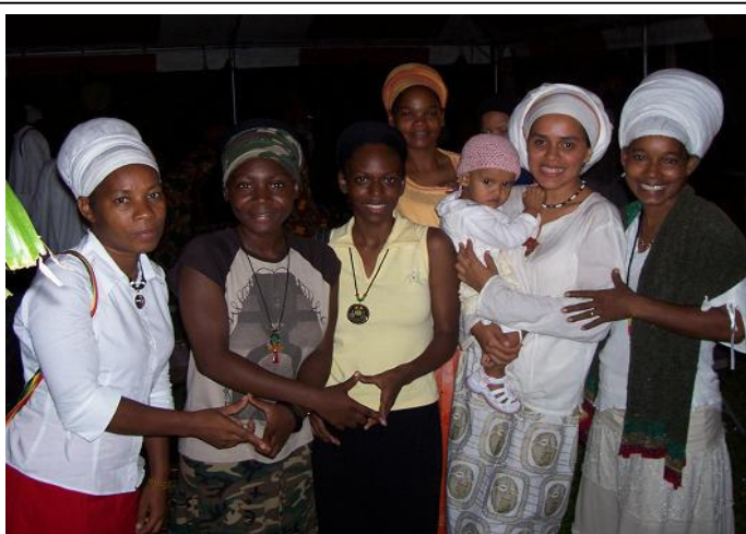
Sistrens at the Trinity Trod Conference (St. Kitts – July 23 rd 2006)

More joy, more love, more prosperity.....Blessed Love