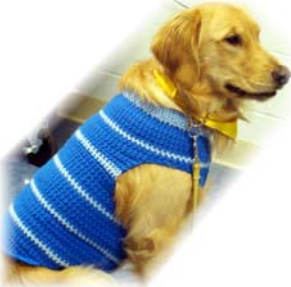
CLARKE Hearts of Gold Service Dog

During September through December 2007, CLARKE continued his Intermediate Service Dog training at USPH and also accomplished additional socialization training with the assistance of WVU students as part of their "Capstone" projects within the WVU Center for Civic Engagement.