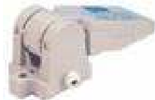
EXAMPLES OF TYPICAL FLOAT SWITCHES