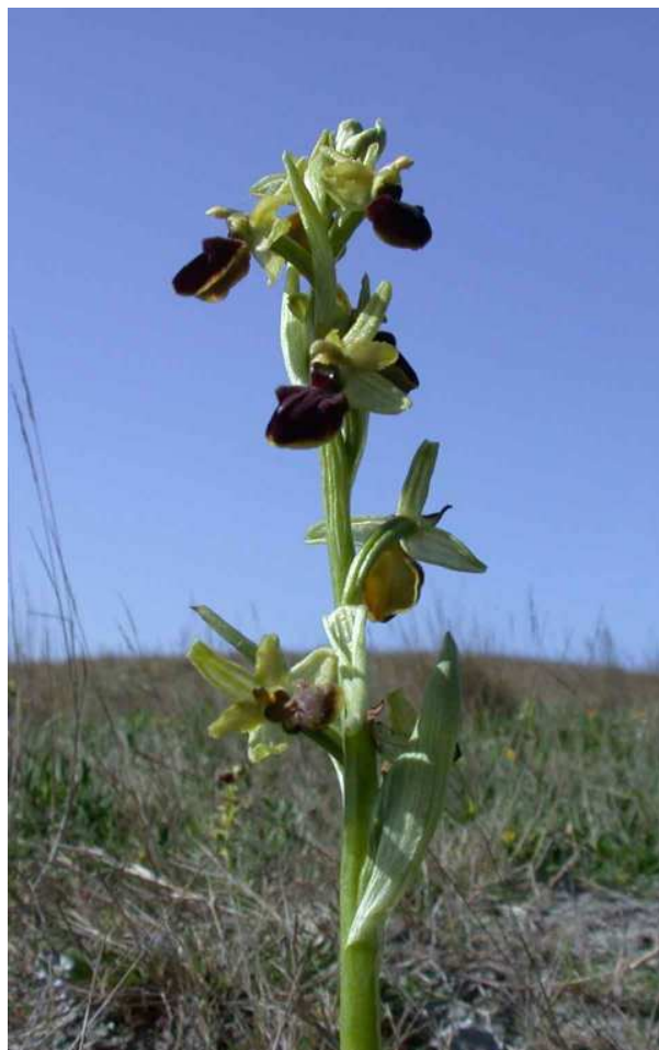
Early Spider Orchid - Sapphire Hoe

The site is home to a wide range of other wildlife including impressive numbers of Early Spider Orchid (12,000 in 2006) and moths such as the Six-belted Clearwing. (photos below)