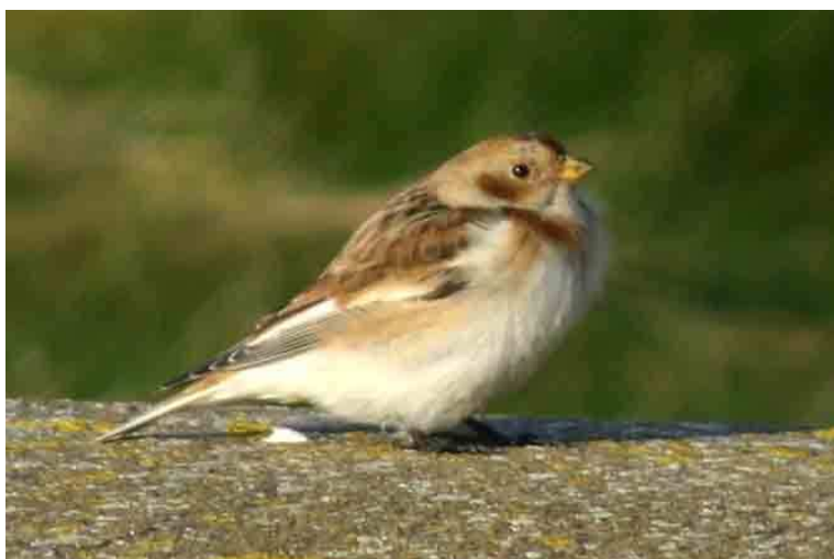
Snow Bunting - Samphire Hoe