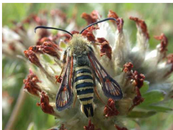
Six-belted Clearwing - Sapphire Hoe