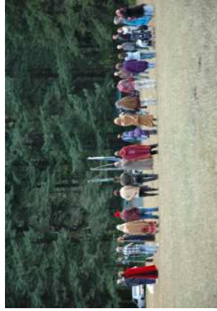
Celebrating the Partnership Pole in the Celtic tradition.

Our vision as the Earth Gatherings lies in being a leading movement in alternative, sustainable life-styles combining the best of modern civilization with proven, effective, traditional techniques gleaned from indigenous cultures throughout the world to help us live in harmony with nature and restore balance between civilization and wilderness.