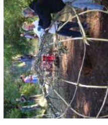
Building an Inipi lodge for a traditional Lakota sweat ceremony.

community where families and friends can work and live together in a safe and intelligent manner.