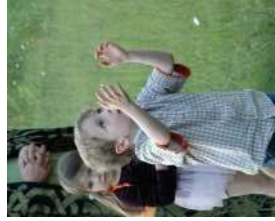
Enjoying our family-friendly atmosphere.

These events provide the opportunity for people to gather, appreciate diversity, and bring peace and harmony through heightened awareness and understanding into our lives.