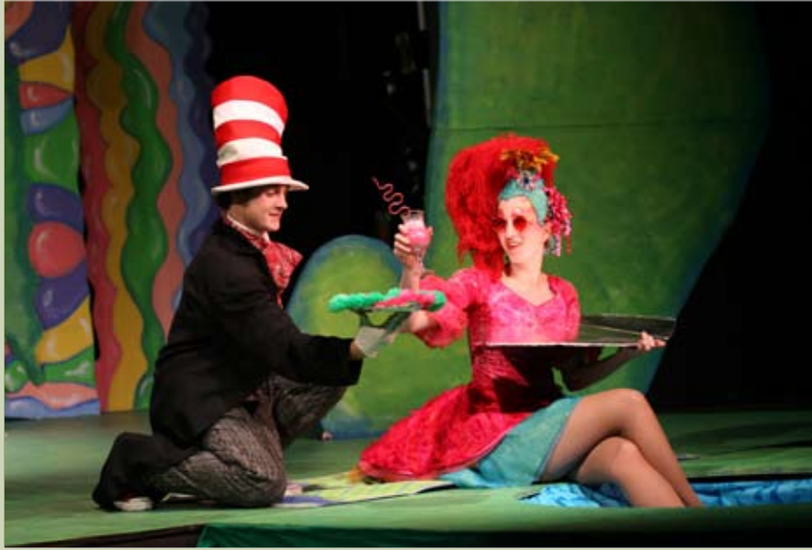
Seussical the Musical